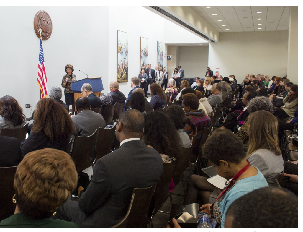
Rep. Maxine Waters (CA) addresses NCRC's Hill Day participants

Through this coalition, NCRC leads a grassroots constituency that works together to solve problems that prevent people from attaining economic prosperity.