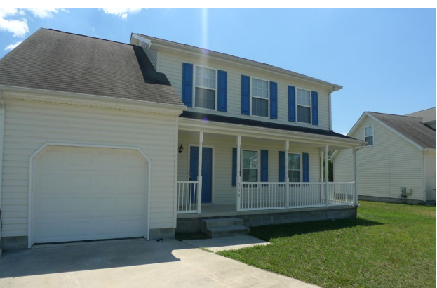
Homes renovated by the GROWTH Initiative